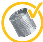
Tins (place lid inside the squashed can)