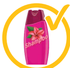
Shampoo containers (empty)