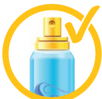
Empty aerosols (no lids)