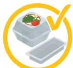
Punnets and biscuit trays