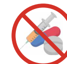
NO medical waste