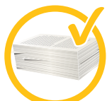
Paper & envelopes