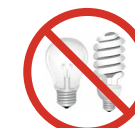
NO light globes