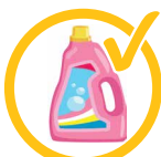
Detergent containers (lids on)