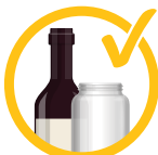
Jars & bottles (empty & no lids)