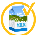
Milk & juice cartons (empty)