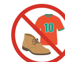
NO clothing footwear or textiles