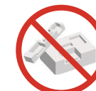
NO foam, polystyrene or shredded paper