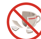
NO broken glassware or crockery