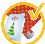
Wrapping paper and cards