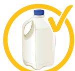
Milk bottles (lids on)