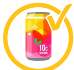
Cans (or return to recycling depots for 10c deposit)