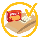
Flattened cardboard packaging