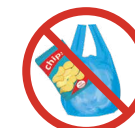
NO soft plastic bags or wrapping