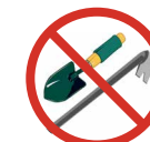
NO large steel items (eg crowbar, tools)

Lots of items can be recycled, but not all in our kerbside collection. See pages 10 and 11 for disposal options.