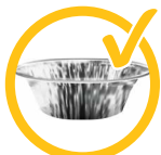
Aluminium foil (clean & squashed into a ball)