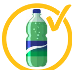
Drink bottles (lids on)