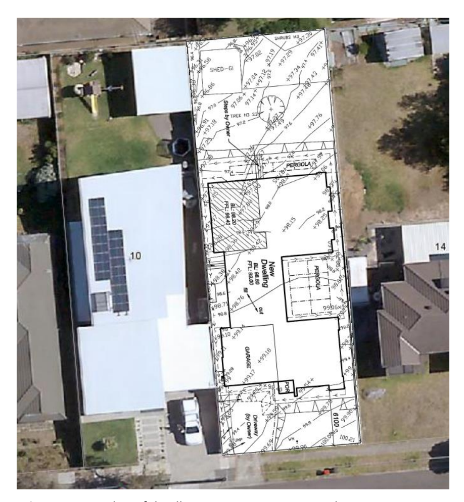
Figure 1: Site plan of dwelling superimpose on aerial image.